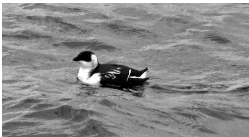
Dovekie