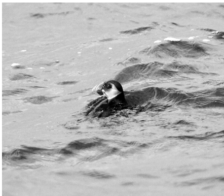
Atlantic Puffin by Len Medlock.

On the way out, we found our first alcids, a handful of Black Guillemots and Razorbills. Thanks to the calm seas, we were able to land on Star Island for a bit of a break from the boat and made an attempt to find some overwintering landbirds. Although landbirds were in short supply, we did have the first count record of White-winged Crossbill. We also had a Common Redpoll and a Black-capped Chickadee, the latter being quite rare on the island and only marking the fourth count record. The real highlight of the island visit, though, was a Dovekie, very close off the south-east end of the island.