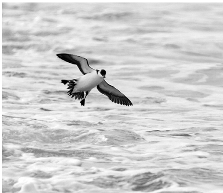
Razorbill by Len Medlock.