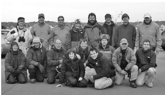
The hearty group of Isles of Shoals CBC participants