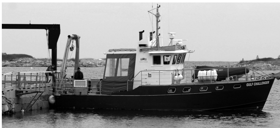
R/V Gulf Challenger on the dock at Star Island.

After leaving Star Island, we circled the Isles of Shoals and travelled north to Boon Island in Maine. We began throwing bread off the stern of the boat to “chum” for gulls. Although we had below-average gull numbers, we had nice views of six Black-legged Kittiwakes, and even had a Razorbill following the boat! The trip north featured a few more Dovekies as well as extended, close views of two Atlantic Puffins! We wrapped up the trip with a group of six Harlequin Ducks at Boon Island before heading back to shore.