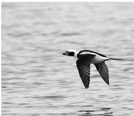
Long-tailed Duck by Len Medlock.